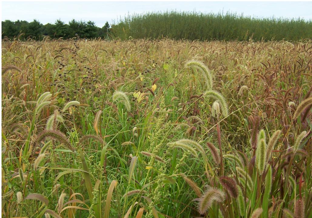
Figure 4. Perennial grass small plot trial located in Jefferson County, NY.