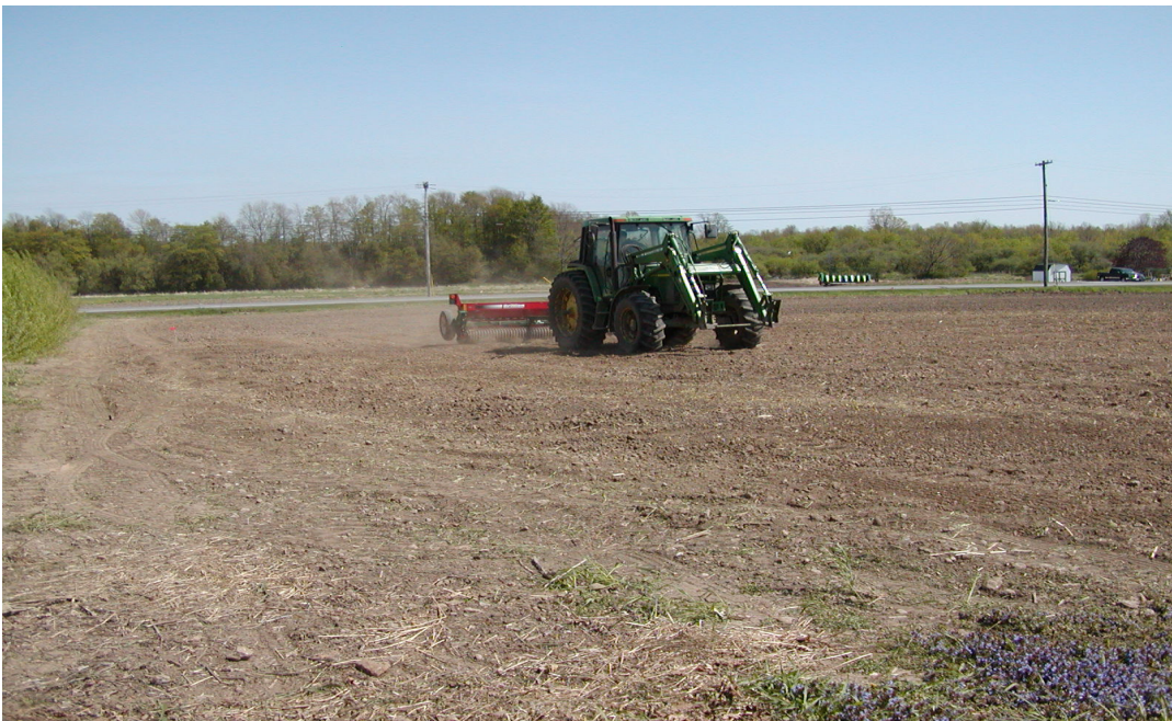
Figure 2. Student from Belleville-Henderson Central School helps prepare field for planting biofuel perennial grass cultivar evaluation trial established in May 2007.