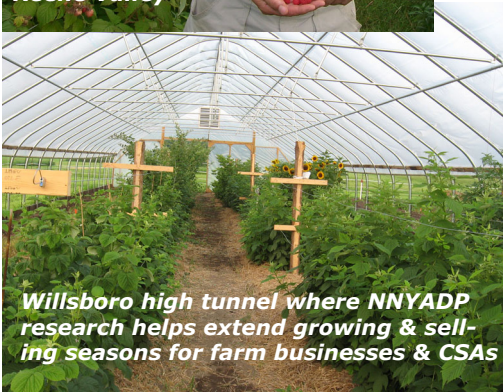
Willsboro high tunnel where NNYADP research helps extend growing & selling seasons for farm businesses & CSAs