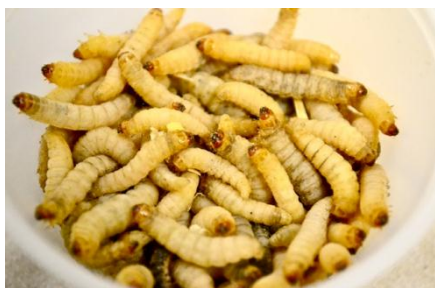
Nematodes are located inside of host wax worm larvae.