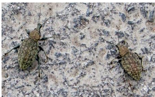
ASB crossing an asphalt road in Lewis County.

Biological control using entomopathogenic (insect-attacking) nematodes is a successful management strategy. NY-native persistent nematodes are available for application on grower fields to reduce ASB populations. Producers are now able to rear and apply nematodes to their own fields. More than 72 farms have applied biological control nematodes on more than 154 fields in six northern NY counties.