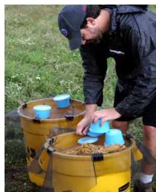
Using screens over trash cans to filter sawdust and wax worms from nematodes for field application.