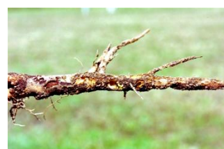
Root feeding by ASB.