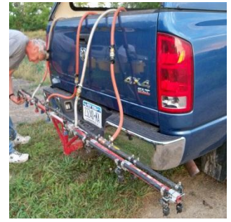
ATV and truck spray rig examples. For more information on building your own spray rig, contact the Shields Lab.