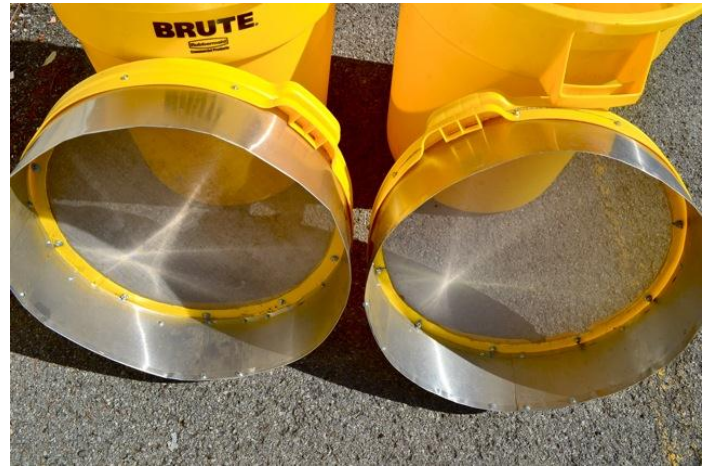
Trash can screen examples. For more information on building your own screen, contact the Shields Lab.

We would like to thank Kara Dunn and the following agencies for their continuing support: