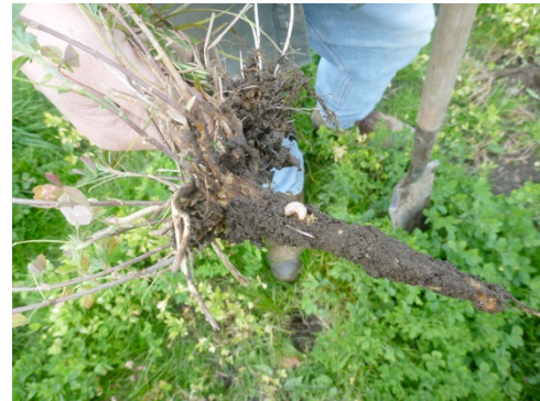
Damaged alfalfa roots and an alfalfa snout beetle larvae. St. Lawrence County, 2013.

Some farms have inoculated the majority of their alfalfa acres while a number of farms have only inoculated 1-2 fields. Early adopting producers, who have treated multiple fields within an area have reported a significant decline of ASB on their farm and have returned to growing alfalfa successfully. The decline in ASB population in an area has taken 3-5 years after multiple fields were treated. In contrast, farmers who have treated only a couple of fields in an area are not seeing much impact on their ASB populations. For these reasons, this cost-sharing program was developed to encourage more growers to treat fields within problematic ASB areas.